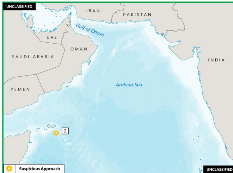
(U) Figure 4. Arabian Sea Piracy and Armed Robbery at Sea

1. (U) GULF OF ADEN: On 24 April at 0900 UTC, an anti-ship ballistic missile (ASBM) launched from Houthi-controlled territory in Yemen targeted the U.S.-flagged container ship MAERSK YORKTOWN while underway approximately 72 NM southeast of Djibouti, near position 11:18N – 044:18E. U.S. Central Command confirmed that coalition forces engaged and destroyed the ASBM. The master reported an explosion in the water at a distance from the vessel. The vessel and crew were reported safe. (UKMTO; Clearwater Dynamics; Maritime Executive; vesseltracker.com)