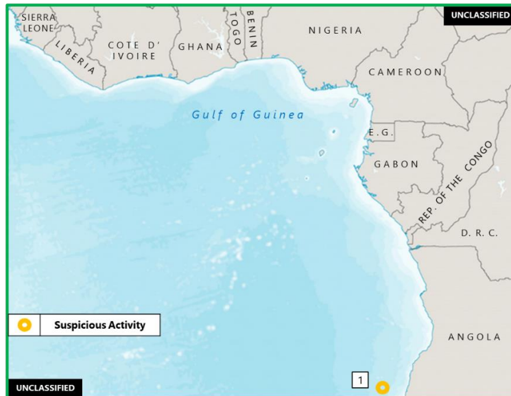
(U) Figure 2. West Africa – Gulf of Guinea Piracy and Armed Robbery at Sea