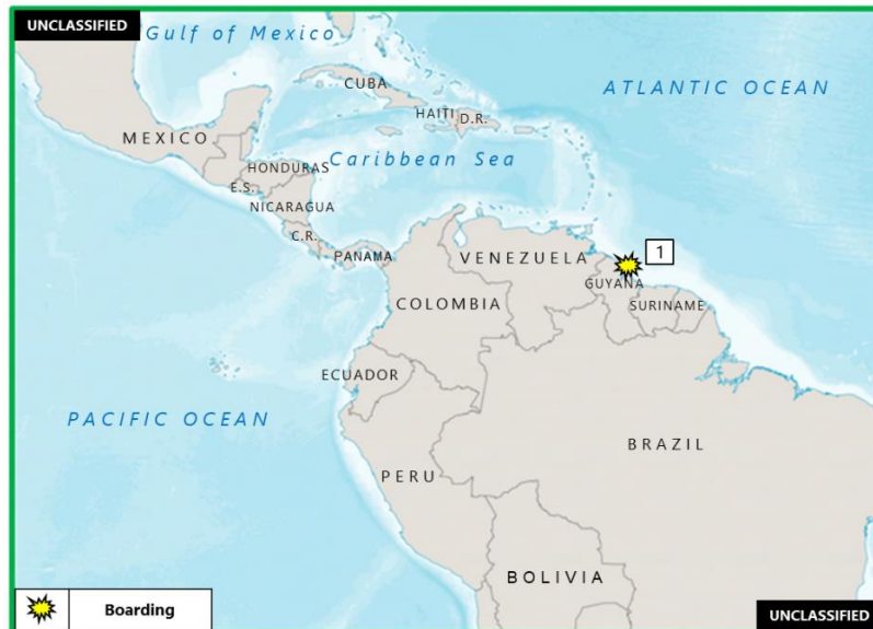
(U) Figure 1. Central America – Caribbean – South America Piracy and Armed Robbery at Sea

B. (U) CENTRAL AMERICA – CARIBBEAN – SOUTH AMERICA: