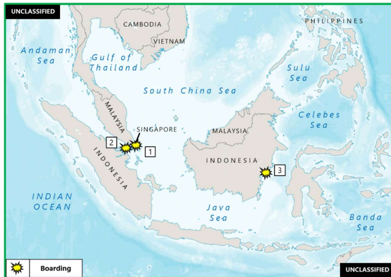
(U) Figure 4. East Asia – Southeast Asia Piracy and Armed Robbery at Sea

1. (U) MALAYSIA: On 14 April at 1020 local time, three or four robbers boarded the barge HEXAGRO 9 under tow by the Malaysia-flagged tug BONGAWAN 9 in the westbound lane of the Singapore Strait Traffic Separation Scheme (TSS), near position 01:18N – 104:15E. Approximately 20 minutes later, the master reported that the robbers had left the barge. The master reported to Singapore Vessel Traffic Information System (VTIS) that the crew was safe, scrap metal had been stolen, and that no assistance was required. (ReCAAP)