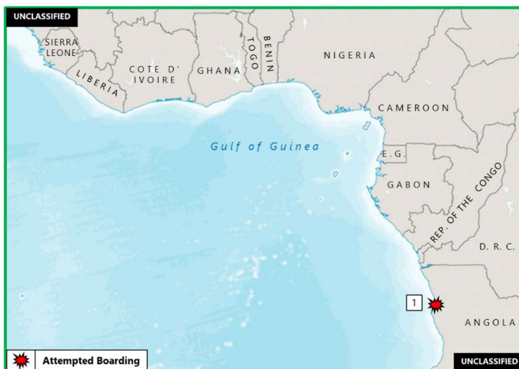
(U) Figure 2. West Africa – Gulf of Guinea Piracy and Armed Robbery at Sea

1. (U) ANGOLA: On 12 April at 0045 local time, two wooden boats approached and lingered on the port side of a fire fighting vessel anchored at Luanda Anchorage, near position 08:44S – 013:18E. The officer of the watch raised the alarm after observing the boats' approach and subsequent landing on the port side of the vessel. Upon hearing the alarm, the boats moved away from the anchored vessel. (Clearwater Dynamics)